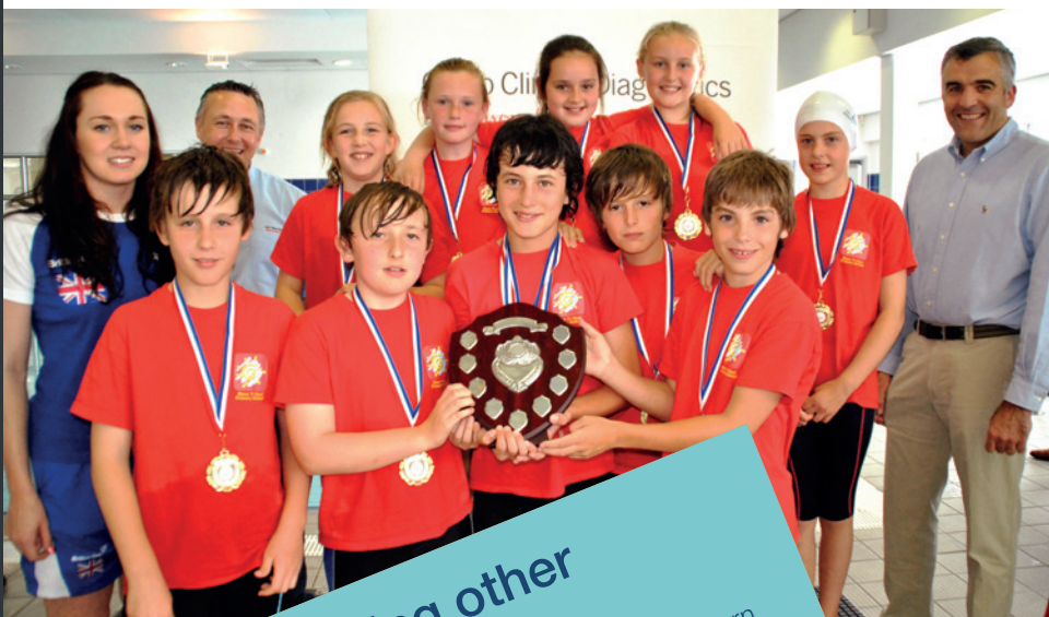
West Park School, take 'Best School' award at the Inter Schools Swimming Gala, Ynysawdre Pool

This year we've continued to offer membership designed for under 17s and seen many more youngsters take that up so they can enjoy unlimited activities across the range. We've extended our range of activities - from gymnastics to trampolining, junior golf to swimming and have group exercise classes specially designed for 8 - 16 year-olds. We also deliver baby and toddler gym sessions, which as well as offering parents super sessions for their little ones, introduces the role of movement (via dance and baby gym) at the earliest ages and helps us start a dialogue with these families that continues in the future.